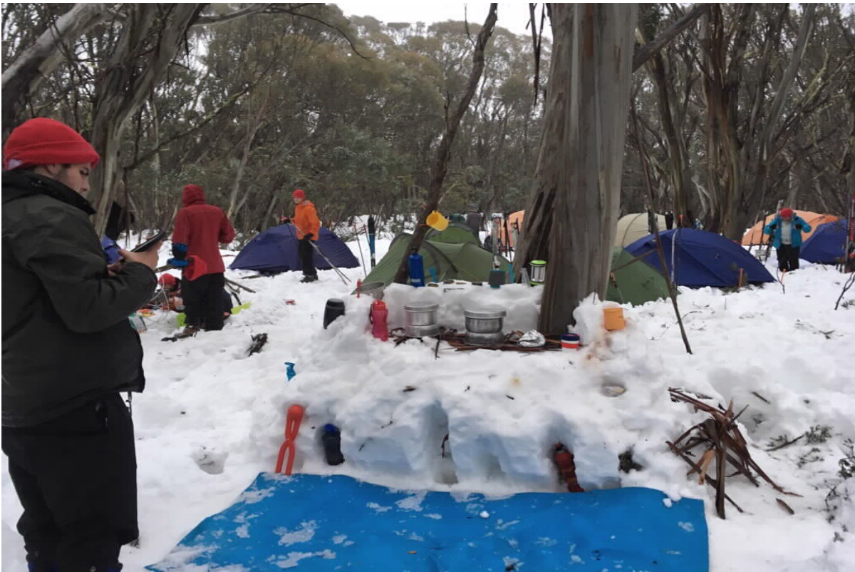
Settled into camp..