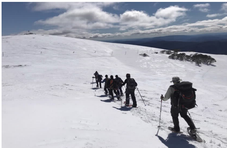
Approaching Stirling Summit