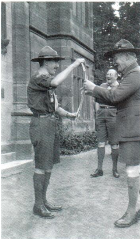
B-P being presented with a pair of braces from the Irish Scouts

In keeping with modern vehicle museum practice, Jam Roll will be maintained in a road-worthy condition, registered and insured. Only drivers approved by the company will be allowed to drive JR on special occasions, such as major Scouting events.