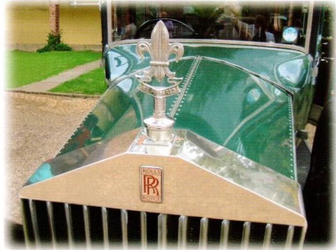
The radiator mascot on Jam Roll

A unique feature of the car is the radiator mascot; the traditional