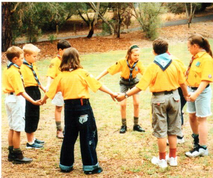
LOWER RIGHT: Cub models plain color polo shirt.