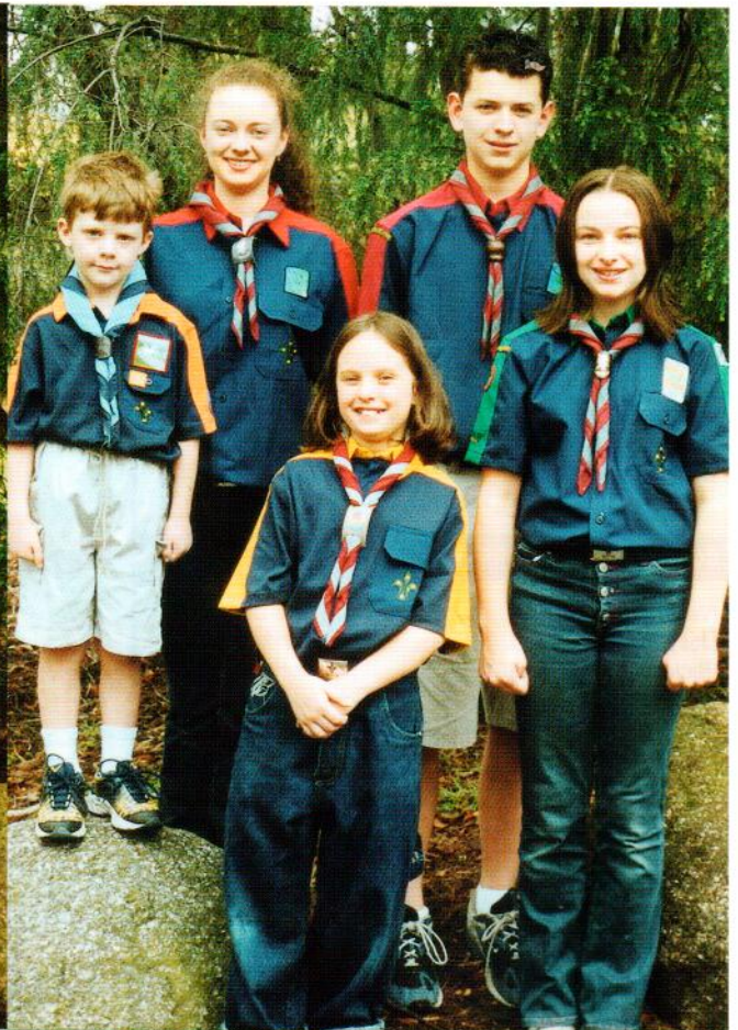
TOP LEFT: Navy blue shirts with section color insets and oversleeve option for badges.