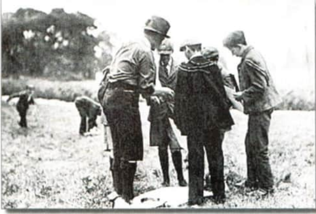
B-P instructing some boys on the Brownsea Island camp in 1907

In this, Scouting's hundredth year (2007) it is worthy of a few moments of reflection on an idea which has had an extraordinary impact on young people throughout the world and continues to do so. An idea so radical at the time, but so simple in concept that it rapidly spread throughout the world. Today there are 28 million (54 million in 2023) young people enjoying the benefits.