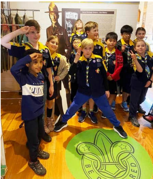
Welcome to the Cubs