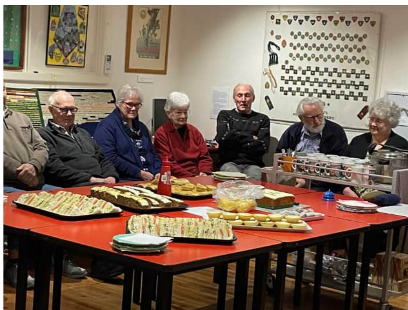
SHV Team gather for lunch