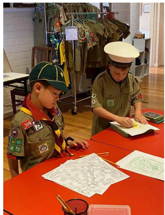
Dress-ups in the Interactive Room