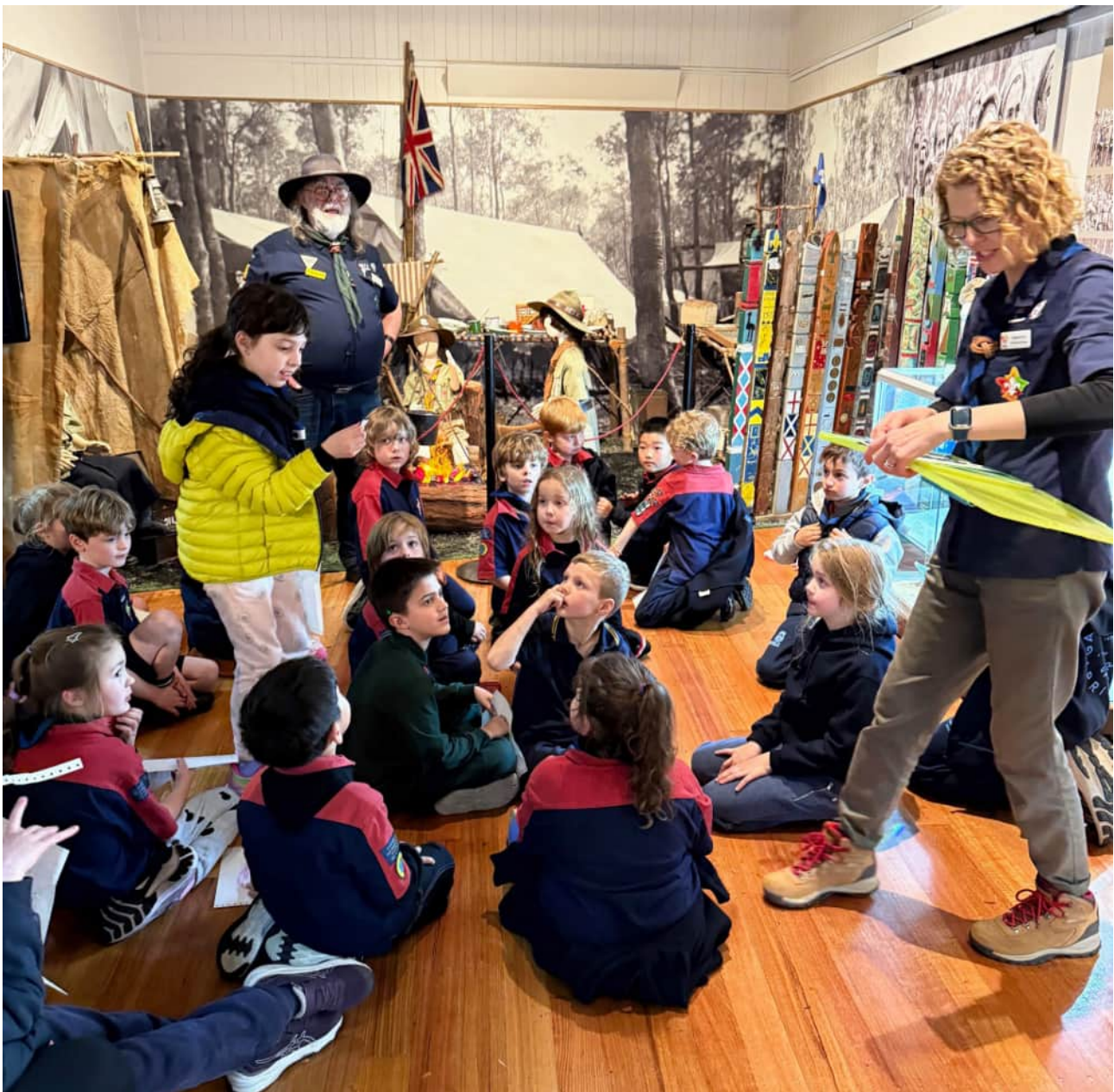
Joeys enjoying their visit