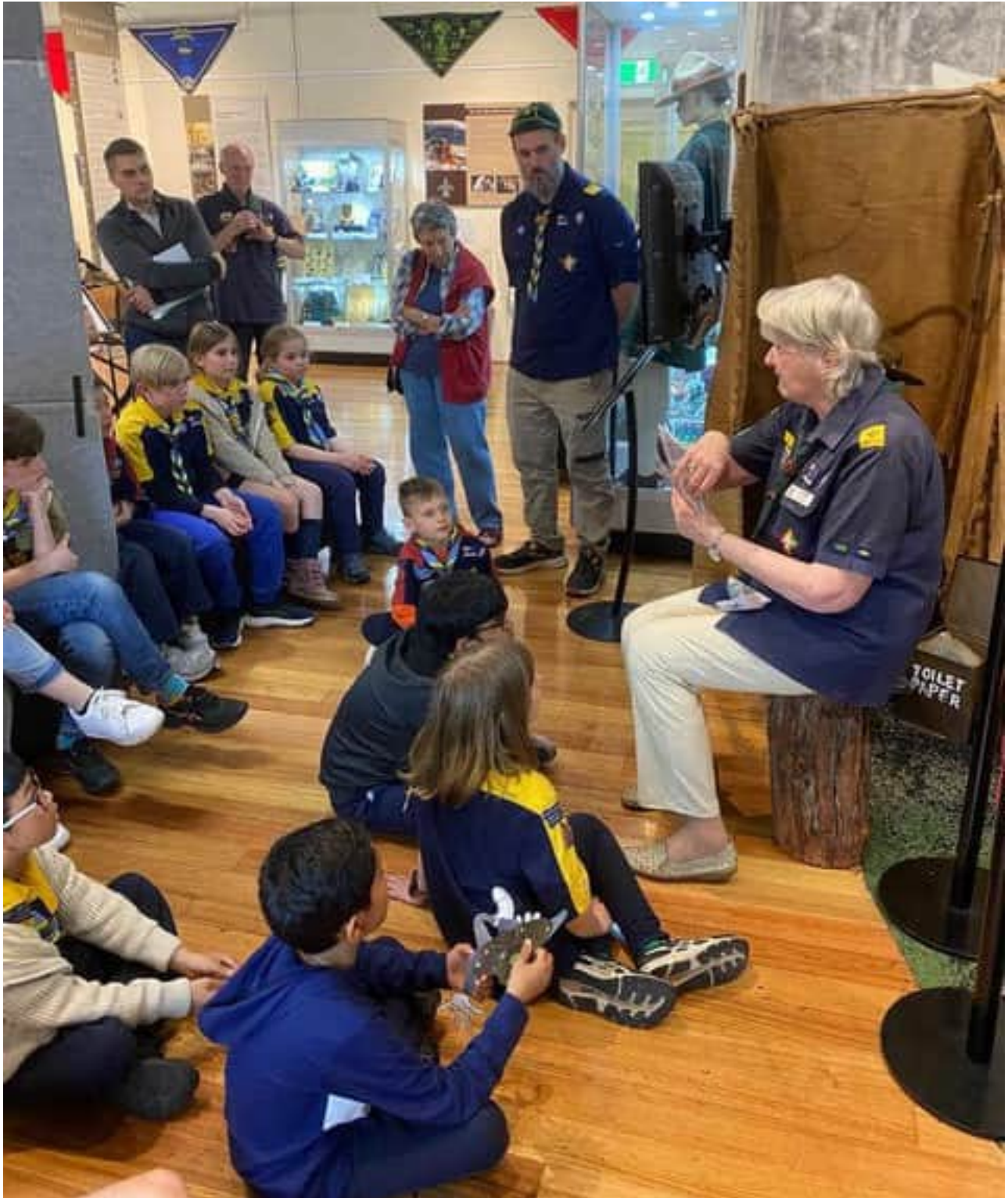
End of the evening yarn at the Campfire