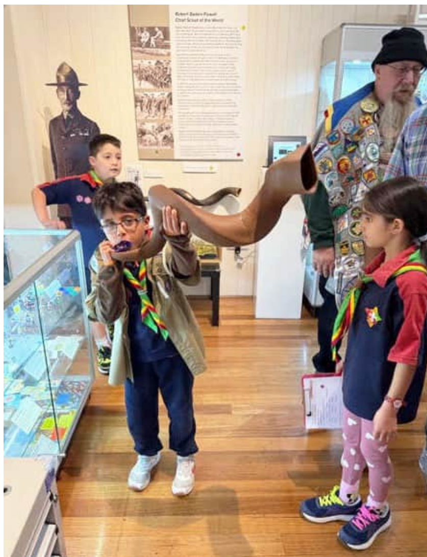
Joeys and our Kudu Horn