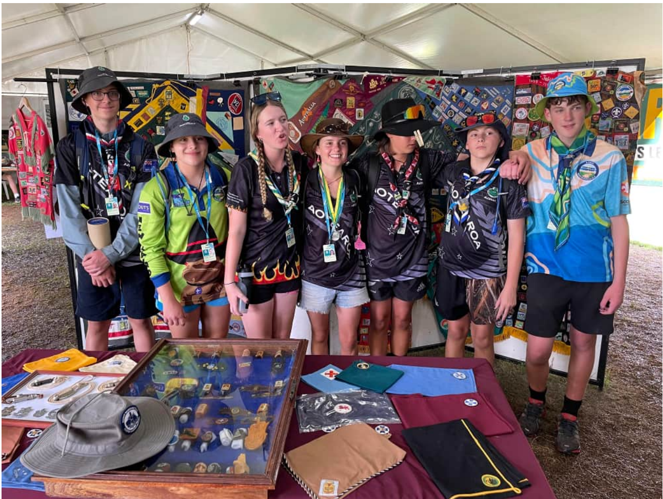
Heritage activity at AJ2025

A large marquee held displays and hands-on activities for the Scouts and Cub and Joey visitors during the event. Victoria took a crate of items and displays on Baden-Powell as part of the Australia-wide Heritage Team. The team decided that it was beneficial to setup an Australian Scout Heritage Network and this has been established post Jamboree to have a Scouts Australia folder with the aim to have regular online meetings to discuss Heritage matters and how we can work collaboratively across Australian Scouting.